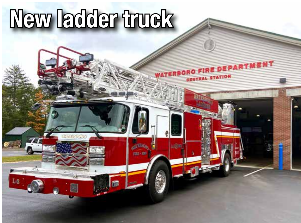
The Town of Waterboro Fire Department has received their new ladder truck, Waterboro Ladder 3. This ladder is 100' with a 500-gallon water tank, accompanied by a 1,500 gpm pump. The truck will be used on the road, at multiple buildings within Waterboro, and possibly out to assist mutual aid calls for neighboring towns for training. “Not including the pre-requisite trainings and certifications, it will take each experienced staff member a minimum of 10 hours of dynamic training to be qualified to drive and operate this truck.” – Fire Marshall, Mike Fraser.

Spectrum is hiring! We are looking for customer service representatives for our Spectrum Mobile department!