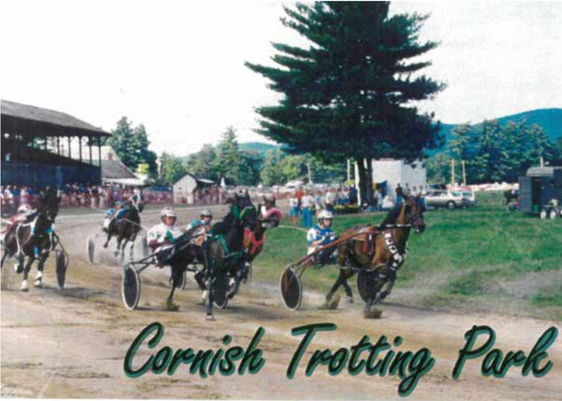
The Cornish Horsemen's Day will be held on Sunday, Sept. 12 starting at noon, featuring live harness racing at the Cornish Fairgrounds on Route 25 in Cornish.

VOLUME 19, ISSUE 35 PO Box 75, North Waterboro, ME 04061 • 247-1033 • www.waterbororeporter.com THURSDAY, SEPTEMBER 2, 2021