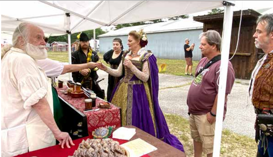
Queen Elizabeth I, tasting some samples from her subjects booth at the Maine Renaissance Faire at the Acton Fairgrounds. The Faire will be open again this weekend, July 24-25.

Gardeners grow food in their 4' x 12' raised beds for themselves, for various organizations, and for local food pantries. Tools, fertilizers, disease and pest control sprays are all provided for this organic gardening project. A produce washing sink, table and chairs, outdoor restroom, and 2 ½ miles of non-motorized trails are other amenities available.