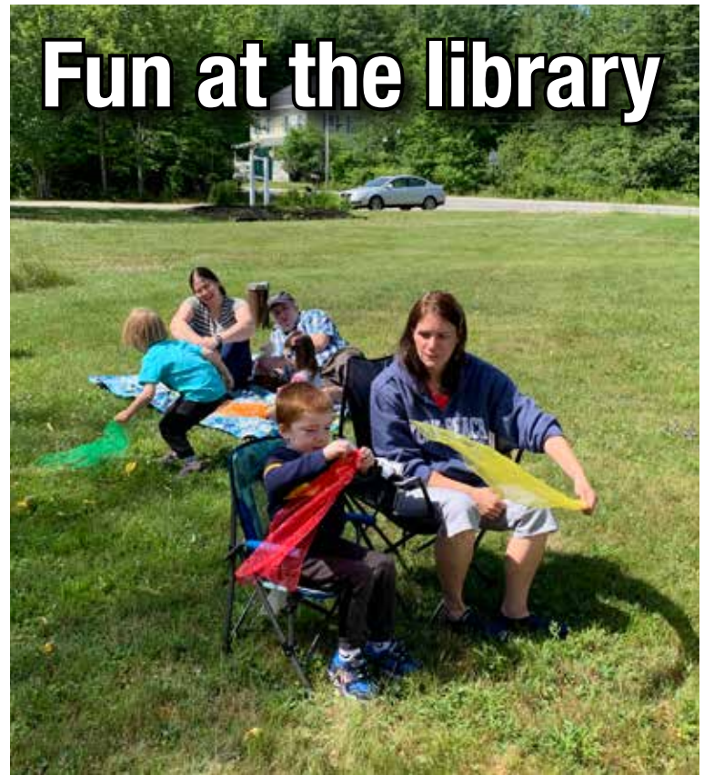
Outside (unmasked) Toddler Story Time at Hollis library Participants enjoyed waving scarves as the "dolphins in the sea go round and round [and] the sands in the sea drift down, down, down." Participants also enjoyed blowing bubbles from handmade bubble wands. Toddler Story Time is held every Monday at 10 a.m. at the Hollis Center Public Library, 14 Little Falls Road, Hollis Center.

Buxton Centre Baptist Church, 938 Long Plains Road, Buxton, weekly SOUPER SENIORS SOCIAL . Gather for conversation, cribbage, puzzles, and other games, every Monday from 10 a.m. to 1 p.m. with a free lunch served at 11:30 a.m. Adults of all ages are welcome. Masks are not required, but we encourage people to be considerate of the health of others.