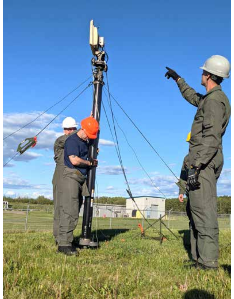
Members of the Maine Air National Guard’s 265th Combat Communications Squadron install communications equipment in support of Exercise Amalgam Dart at Canadian Forces Base Cold Lake in Alberta on June 12.