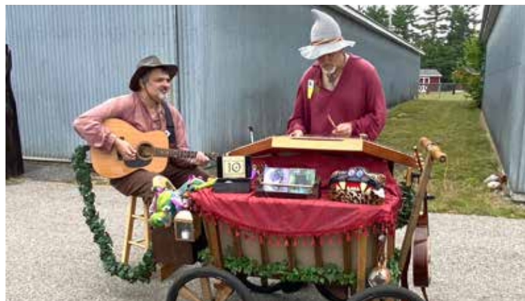
Vendors (above) and Musicians at the Maine Renaissance Faire in Acton.

Other attractions include the food booths scattered throughout the Faire. Smoked Turkey Legs, a favorite in the Elizabethan era, are available as well as more familiar fare such as hot dogs and hamburgers.