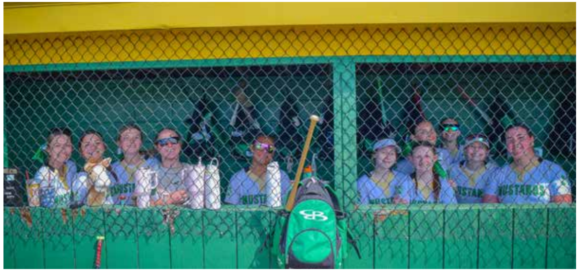
Massabesic Varsity Softball players smile from the dugout at their season opener on April 25.