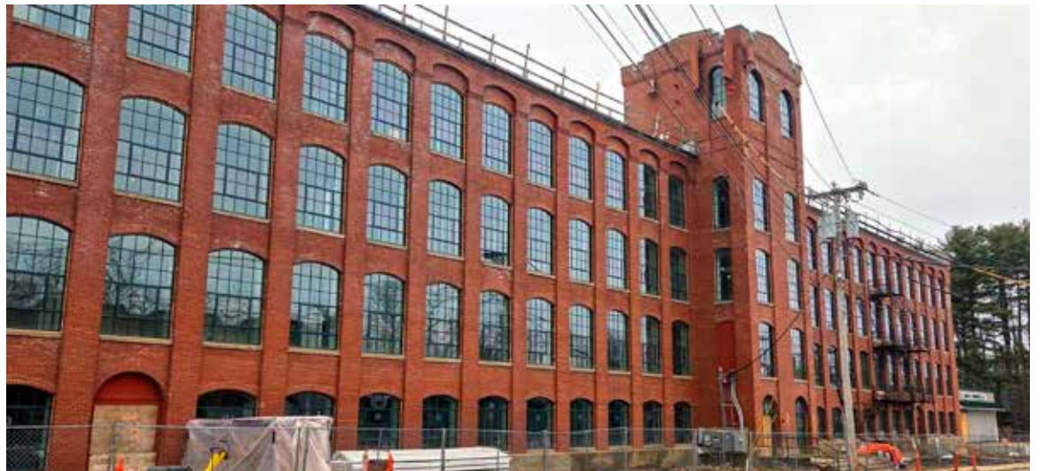
Jagger Mill in Sanford is currently under renovation.