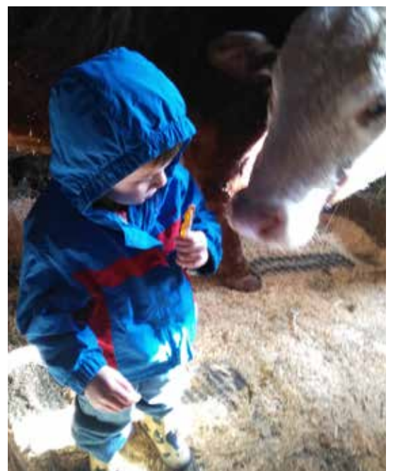
Warren at Triple C Farm & Boilers in Lyman.