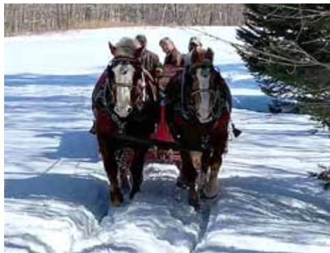
A horse-drawn sleigh ride at Curran Homestead Village at Willowbrook in Newfield.