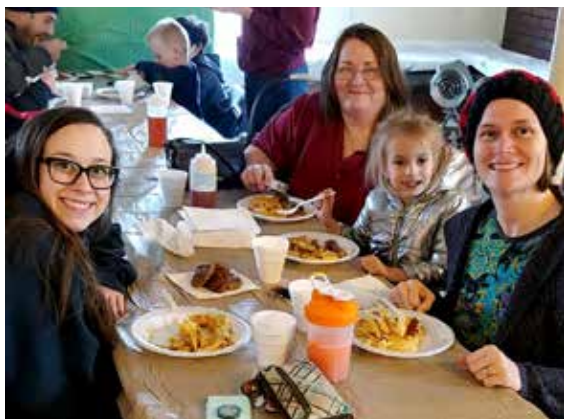
Enjoying the pancake breakfast at Triple C Boilers in Lyman.