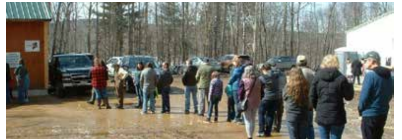
A long line of maple lovers waited patiently outside the Gile and Bushey Sugar house on Maple Sunday.