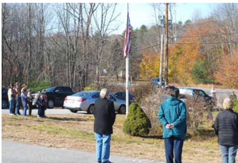
Newfield residents honored veterans at the Veteran's Day ceremony in front of the town office on Water Street, with about 30 attending. Troop #329 raised the flag.

Back in 1954, President Dwight D. Eisenhower first proclaimed that November 11, would be called Veteran's Day in honor of our men and women who served in the armed forces, and those who fought the