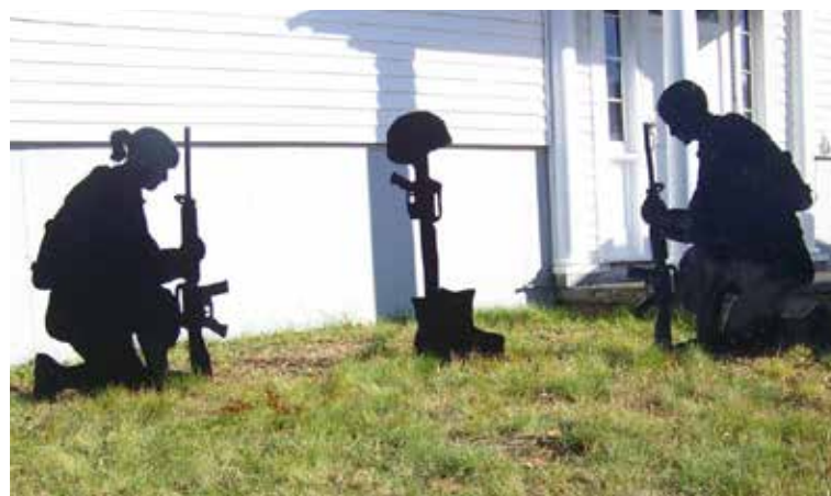
During the recent craft fair at the Masonic Hall in Alfred, these figures on the lawn represented what it was all about: MIA (Missing in Action) and POW (Prisoners of War).

PLEASE CALL 636-2844 EXT 1 OR 6 FOR ADDITIONAL INFORMATION