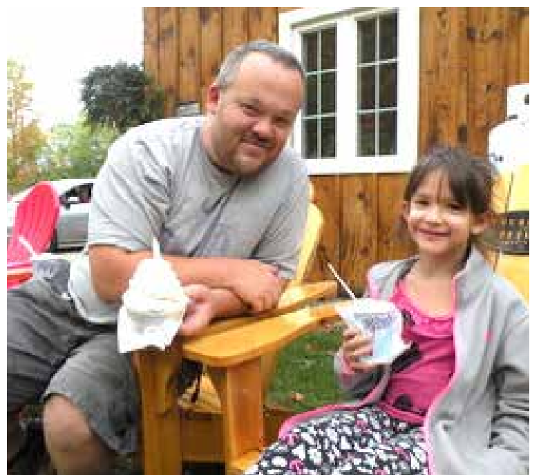
Visitors enjoying their ice cream at Thurston and Peters Sugarhouse's annual "Clean out the ice cream freezer..." event held recently to raise money for local fuel assistance.