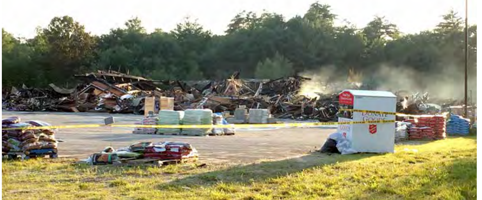
The remains of Brookfield Place in Waterboro at 7 p.m. on Sunday, July 16 after a fire started around 10 a.m. that destroyed the complex at 1009 Main Street. The businesses lost in the fire, of which the cause is undetermined, were Plummer's Ace Hardware, Family Dollar and Asian Taste.