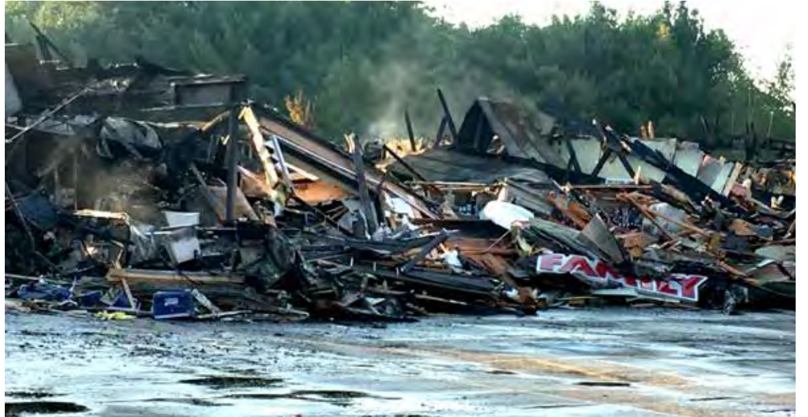
Brookfield Place, located at 1009 Main Street in Waterboro was originally built in 1987 and burned to the ground on Sunday, July 16 after a fire broke at around 10 a.m.