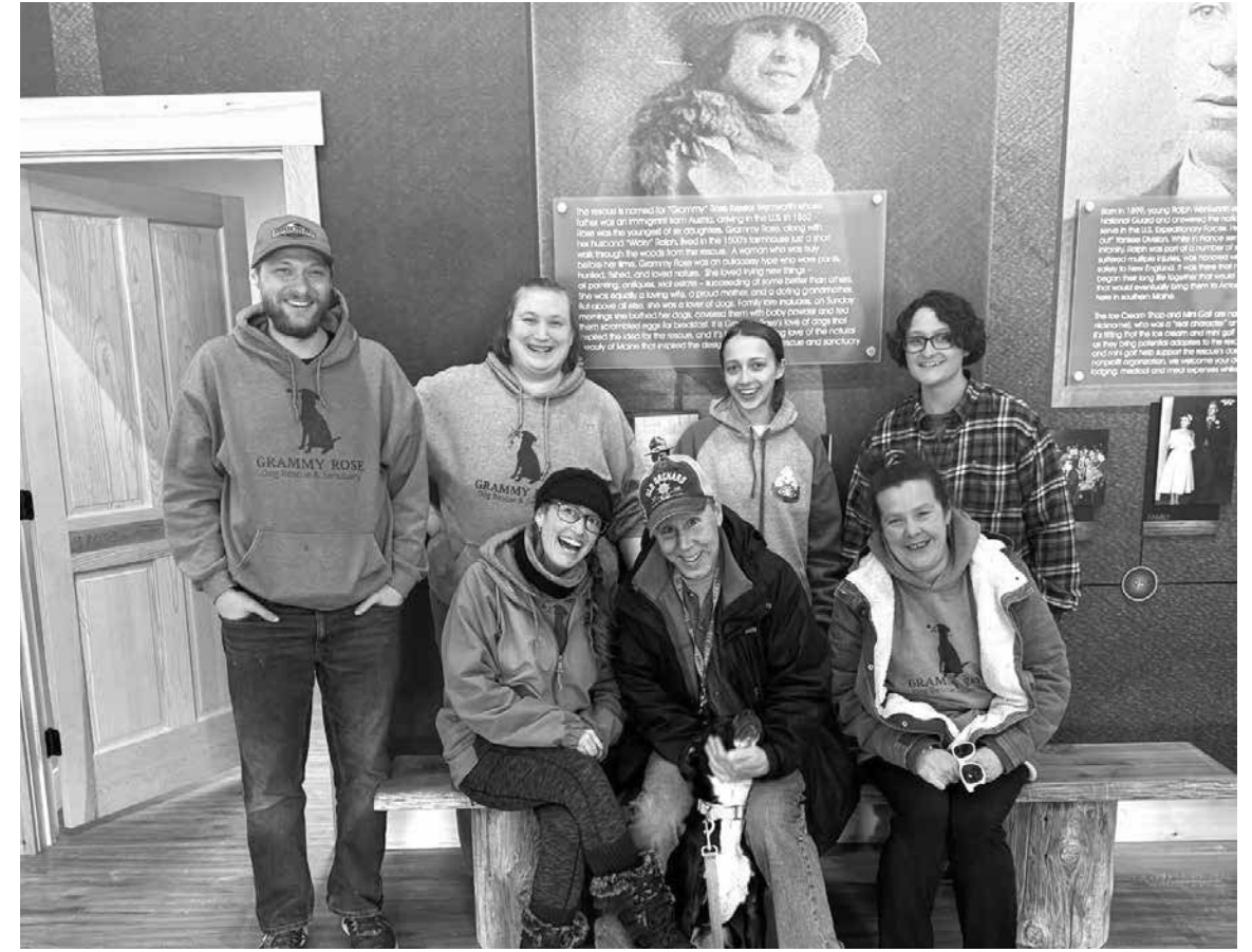
Grammy Rose Dog Rescue and Sanctuary on Route 109 in Acton recently celebrated their 1,000th adoption when Rita went home. Grammy Rose has an on-campus ice cream shop and mini golf course that help fund their work. For more info visit www.grammyrose.org.