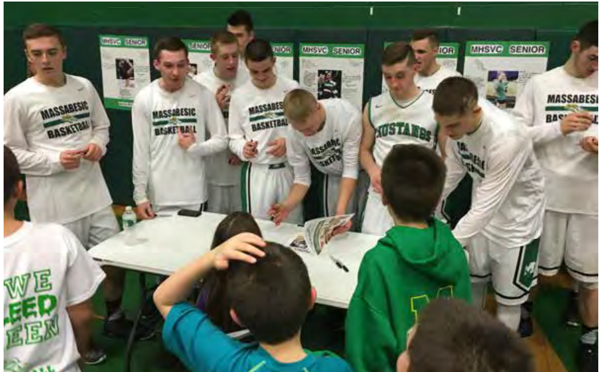
Massabesic varsity basketball players stayed after the game on Feb. 4 to sign autographs for the kids and fans.

The Mustangs were scheduled to face Scarborough (6-12, and a 81-39 loser to host Massabesic back on Jan. 29) in the first round of the class AA south playoffs on Thursday, Feb. 11 at the Expo. The winner advances to the second round at the Expo on Feb. 19.