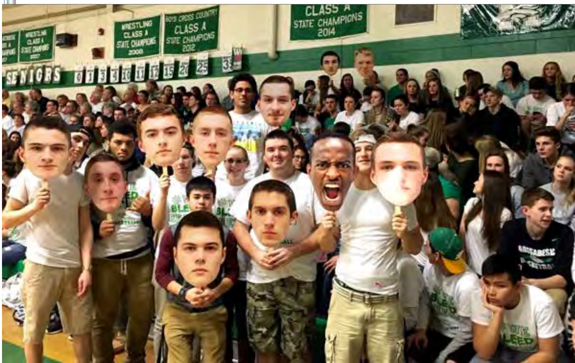
The Massabesic Boys' Varsity Basketball team played Sanford in front of a sold out crowd at Massabesic High School on "Senior Night" and their last regular season game on Thursday, Feb. 4. With the help of the fans, all eleven senior players were represented with "fat heads" to cheer them on. (See Page 5 for more.)