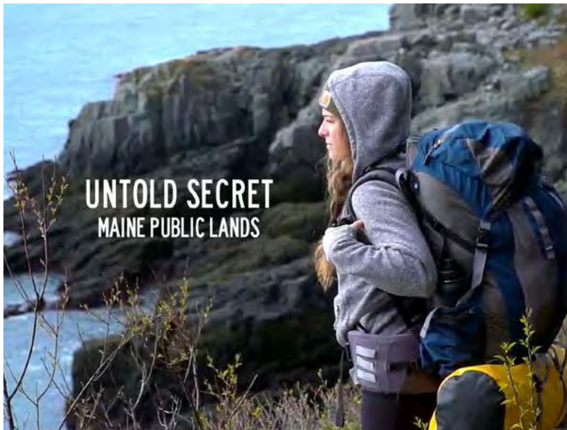
A short film about Maine Public Lands titled Untold Secret has been released to the public.

VOLUME 17, ISSUE 50 PO Box 75, North Waterboro, ME 04061 • 247-1033 • www.waterbororeporter.com THURSDAY, DECEMBER 12, 2019